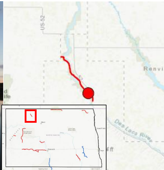
The calming landscapes around Des Lacs National Wildlife Refuge Scenic Byway offer superb wildlife-viewing, hunting, and hiking.