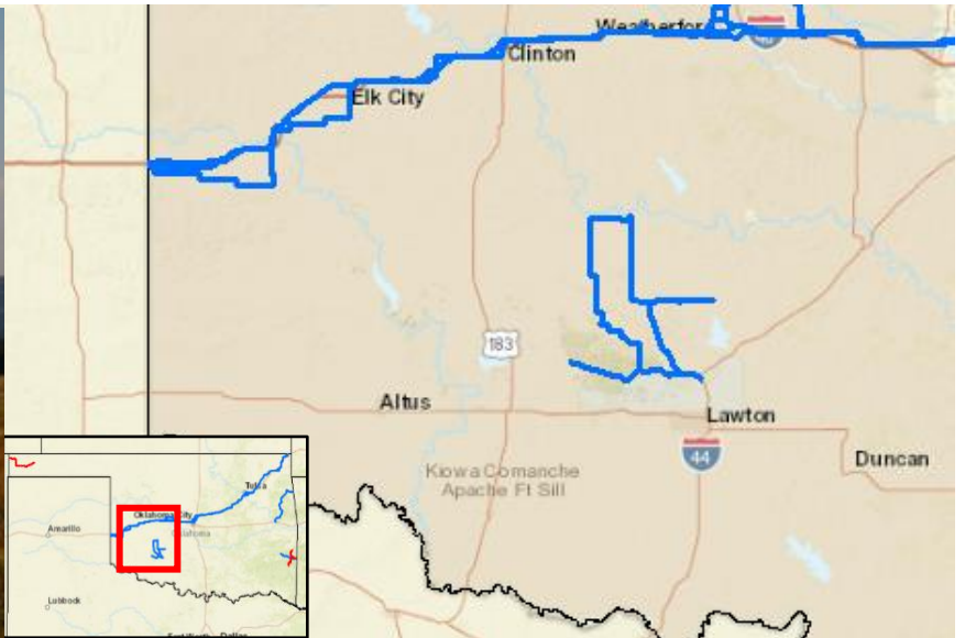
Enjoy the Wichita Mountains National Wildlife Refuge, one of the oldest managed nature preserves in the country, while traveling the Wichita Mountains Byway.