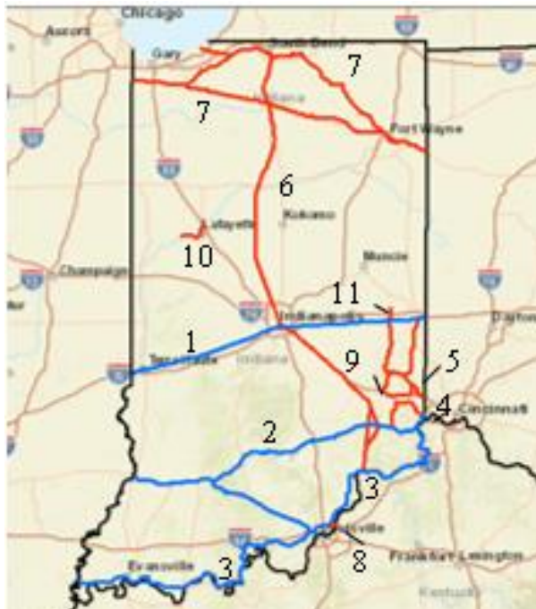
Scenic Byways in Indiana