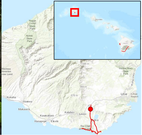
The Holo Holo Koloa Scenic Byway, extremely popular among tourists, traverses through a variety of picturesque landscapes.