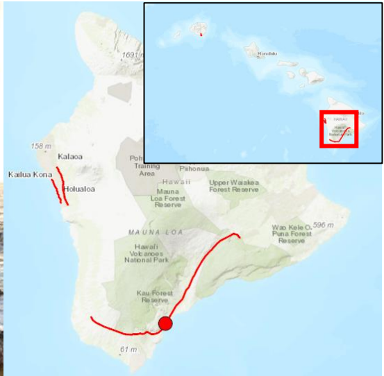
Kau Scenic Byway-The Slopes of Mauna Loa offers breathtaking views of the coast and access to some of Hawaii's historic landmarks.