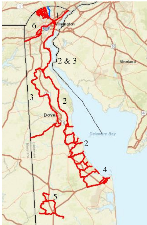
Scenic Byways in Delaware