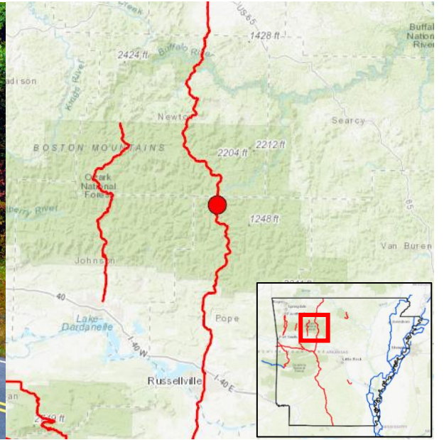
Arkansas 7 Scenic Byway, ranked one of the most scenic drives in America, offers stunning views of Arkansas' picturesque forests.