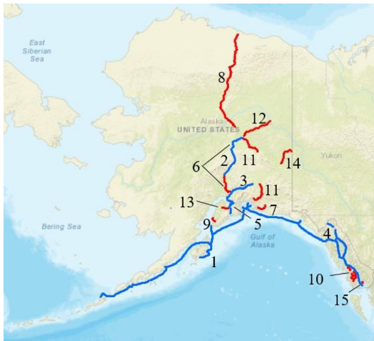
Scenic Byways in Alaska