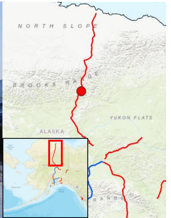
Hazardous, remote, and uniquely scenic, Dalton Highway offers unparalleled adventure.