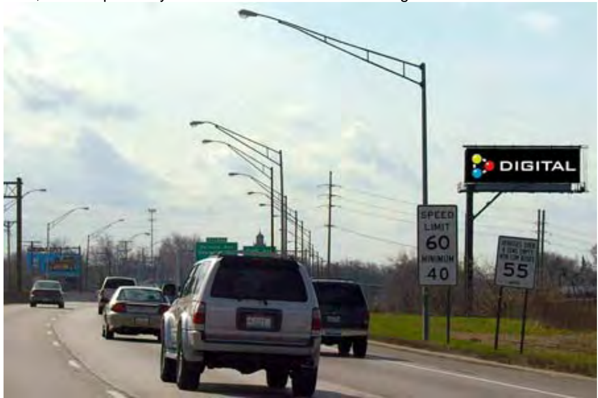
Figure 2. Image showing EBB #4 adjacent to posted Speed Limit signs. This image shows the same EBB depicted in Figure 2-10, p. 17 of the Tantala study. I-77 interchange signs can clearly be seen, as can an additional billboard in the driver's view. This is the same sign represented as Site No. 42 in the Lee report.

this figure clearly shows another billboard within the approaching driver's field of view, and the proximity of this EBB to the I-77 interchange ahead.