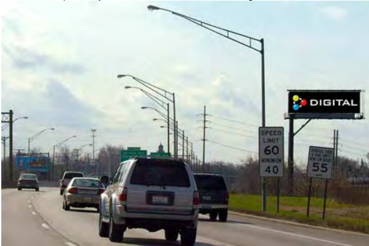
Figure 2. Image showing EBB #4 adjacent to posted Speed Limit signs. This image shows the same EBB depicted in Figure 2-10, p. 17 of the Tantala study. I-77 interchange signs can clearly be seen, as can an additional billboard in the driver's view. This is the same sign represented as Site No. 42 in the Lee report.

this figure clearly shows another billboard within the approaching driver's field of view, and the proximity of this EBB to the I-77 interchange ahead.