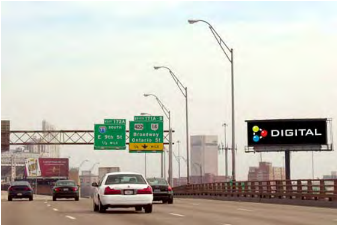
Figure 1. Proximity of EBB #3 to an I-90 interchange. This image shows the same EBB depicted in Figure 2-8, p. 16, of the Tantala study. It is also Site # 22 from the Lee study.

In summary, the researchers' decision to exclude from study crashes that may have been affected by certain "biases" is essentially and critically flawed because it overlooks the most basic understanding of traffic crashes –that they are frequently multi-causal – and it is precisely when such multiple factors are at play – adverse weather, older drivers, complex interchanges, speeding) that the likelihood grows that the cognitive demands on the driver are increased and that irrelevant distraction cannot be tolerated. In other words, one should not exclude such factors because they cause "bias" – these are exactly the factors that interact to increase the likelihood of a crash when other factors such as inattention or distraction are present, and they must be investigated.