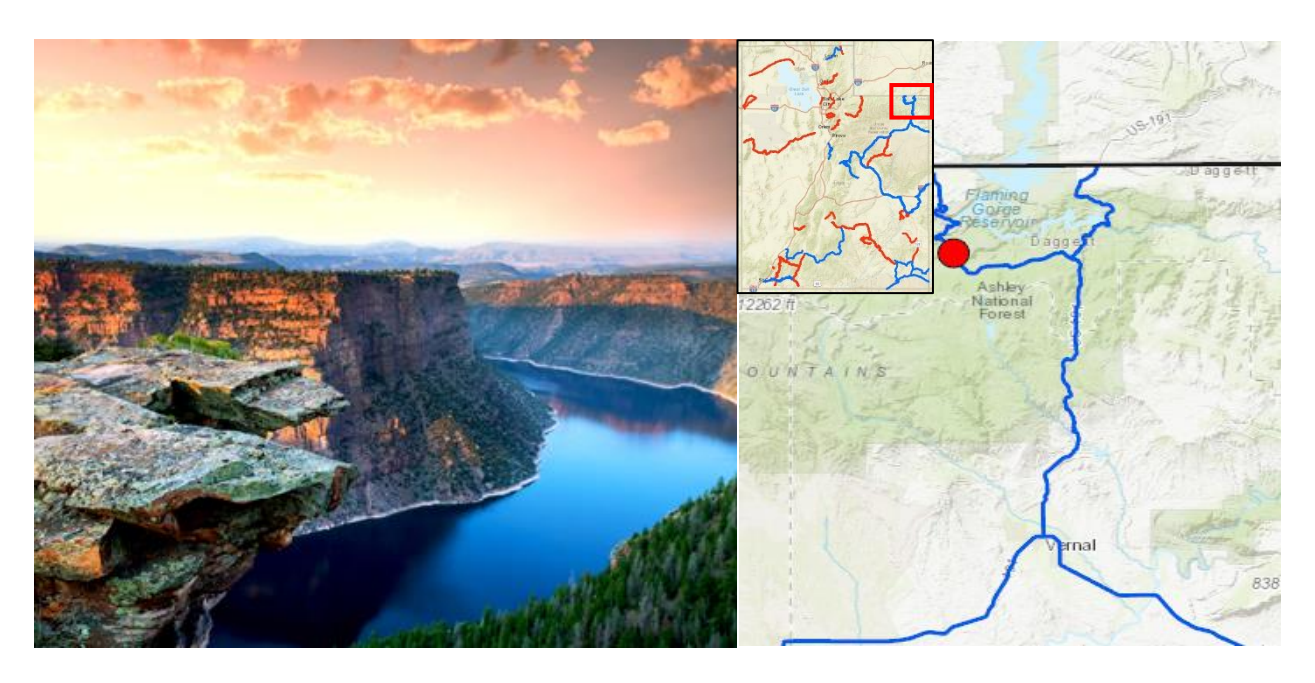
The Flaming Gorge-Uintas National Scenic Byway offers breathtaking views and access to numerous outdoor activities.